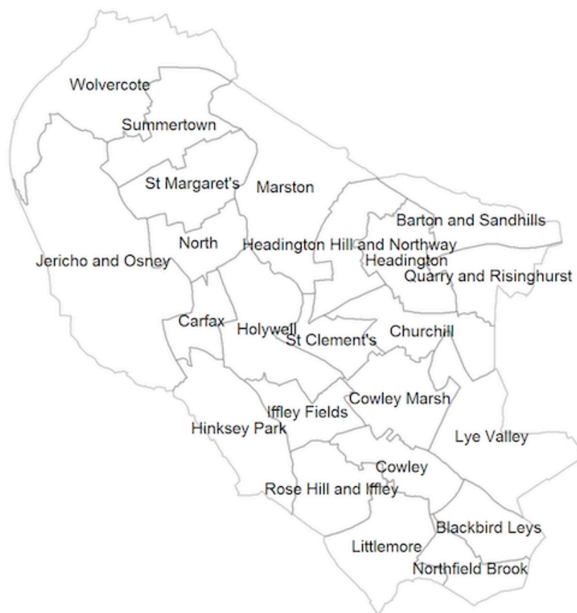
Figure 1 – ward map of Oxford

Although ward boundaries have been altered since we last studied the distribution of mortality in the city in the late 1990s (introducing the possibility of errors arising from the modifiable areal unit problem; Openshaw, 1984), those alterations make the comparisons over time more, not less, valid. This is because boundaries are altered to ensure that each ward still has a similar number of electors. If this were not done, then the wards would become progressively less representative of the population over time and inequalities could appear to rise as underlying population sizes altered.