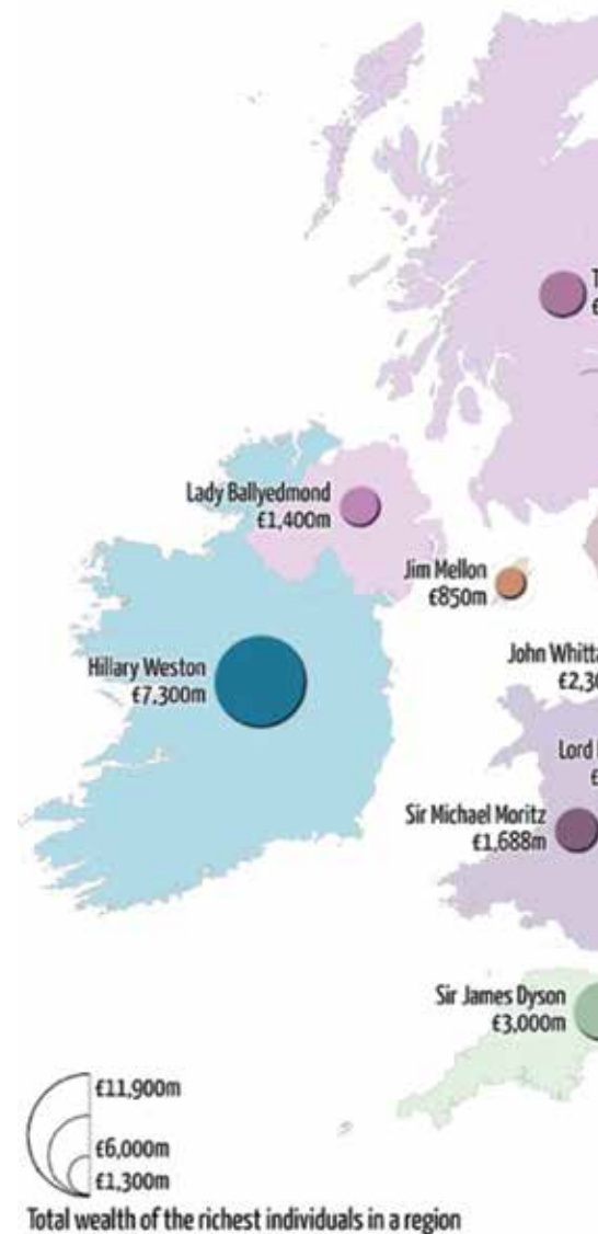
Wealth distribution of the richest 1000 on the British Isles Data Source: The Sunday Times Rich List 2014

to see why when they compare themselves to those just above them even some of the super-wealthy can feel they don't have that much.