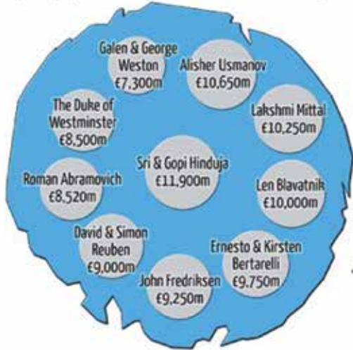
London's super-rich and their estimated wealth (circles proportional to their wealth, same scale as in the map below)