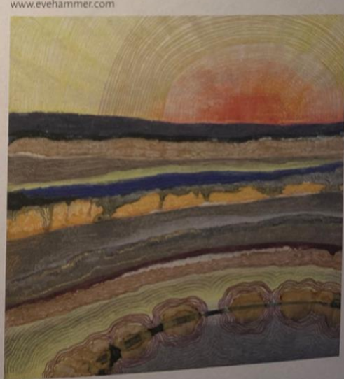
Resurgence & Ecologist 63