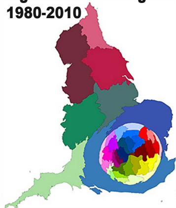
Increase in poor households