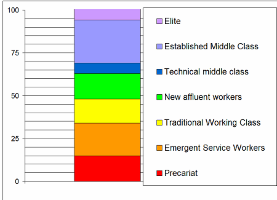
The 'New' 7 Fold class breakdown, % of people in Britain by label, 2013

Critics of the BBC/Sociologists' seven fold classification suggested in early April that it emerged mostly as the result of arbitrary pattern searching and is new mainly in that it tends to split the young from the old. There have been more carefully thought out seven or eight category schema produced before (not least the official NS_SEC) (5). However, while some disagreed with their methods, others in the media appeared to bend the story what the academics found to better suit their particular slant. The Daily Mail found a pundit willing to claim that the survey '...also shows there is plenty of social mobility – even the Precariat can escape more easily than the working class of 50 years ago' (6). The survey included nothing about changes over time, and the evidence that exists from other surveys finds the opposite to be the case.